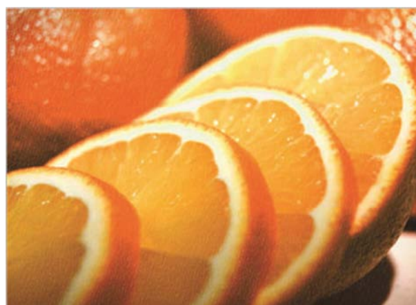
Figure 1. Slice of Oranges [46].

The education funding Agency (EFA) global monitoring report [13] states that more than quarter of students or children below fifteen years of age in sub-Saharan Africa are underweight due to poor feeding, making them more vulnerable to disease and less able to concentrate in school. Studies on effects of Poor feeding pattern shows an association between Poor feeding pattern and lower cognitive performance and depression [14, 15, 16, 17]. Poor feeding research helps characterized the impact of malnutrition on the quality of life. A study in Lagos and Ibadan shows that Poor feeding pattern is over 70% [18]. Poor feeding pattern not only affects physical growth and health of children but also their mental and intellectual development, school attendance and academic achievement [18]. Therefore, addressing poor feeding requires knowing the groups and communities affected which is the purpose of this study, to determine poor feeding pattern as a factor militating against students' academic achievement in chemistry which is a mechanism to sustainable development.