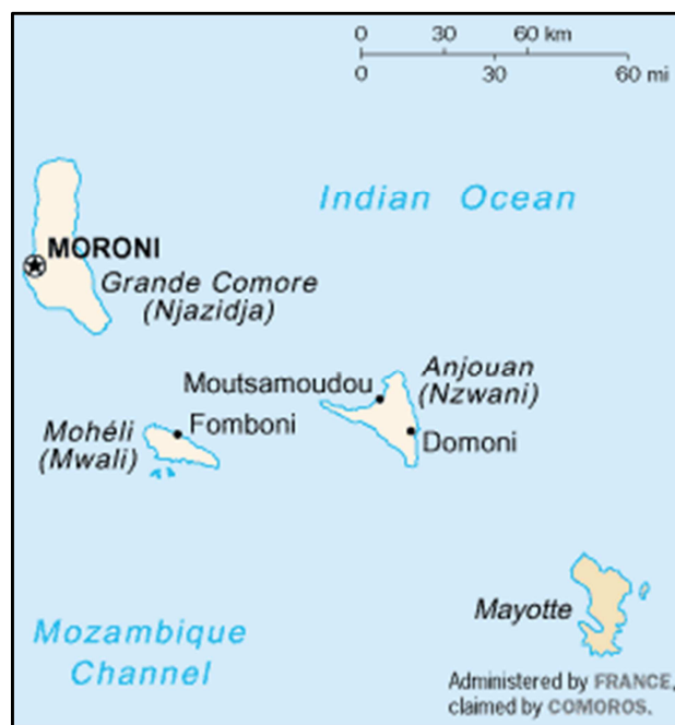
Figure 1. The geographical location of the Comoros.

As we mentioned previously, the country of the Comoros,