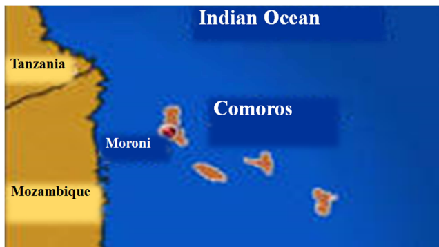
Figure 2. Political borders of the Comoros.

The State of the Comoros is considered a completely maritime country, as it is made up of four large islands in addition to some small islands, which are located in the southwest of the Indian Ocean, south of the continent of Africa. This means that water surrounds it on all sides, and as we mentioned previously, it is located between the shores of both... Tanzania, Mozambique and Madagascar are near the eastern African coast, and this location makes them an eastern-southern gateway to the African continent and a connecting factor between the Middle East and the world.