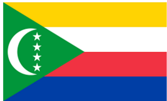
Figure 4. Flog of the Republic of Comoros.

The bottom line is, "Yes," there are weaknesses represented by the geographical location in addition to the strengths. However, the strengths, if exploited optimally, will reduce the impact of the weaknesses on the state. In addition, the strengths can be exploited by the Comorian people immediately, unlike the weaknesses that either It rarely affects or is either required, let us call it, by weak points of entry into a state of war, or by natural factors that may or may not occur. After this report, we leave the decision to the Comorian people to decide whether to exploit this resource or not?