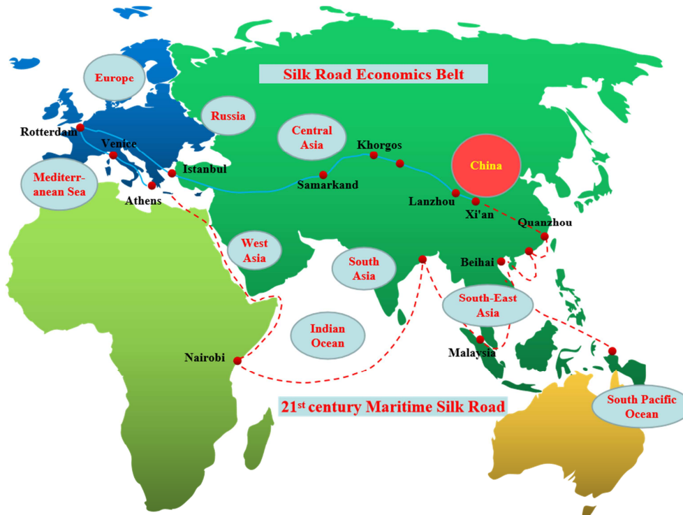
Figure 1. Countries and cities along the "B&R".

learn how to enhance the Soft Power of Education and Culture in China; finally study how to promote peaceful development and achieve win-win cooperation between countries.