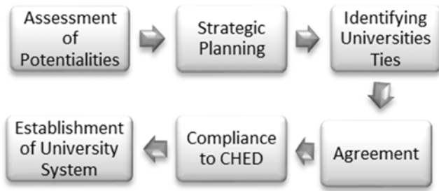
Figure 2. Stages of Transforming a University/College into a University System.