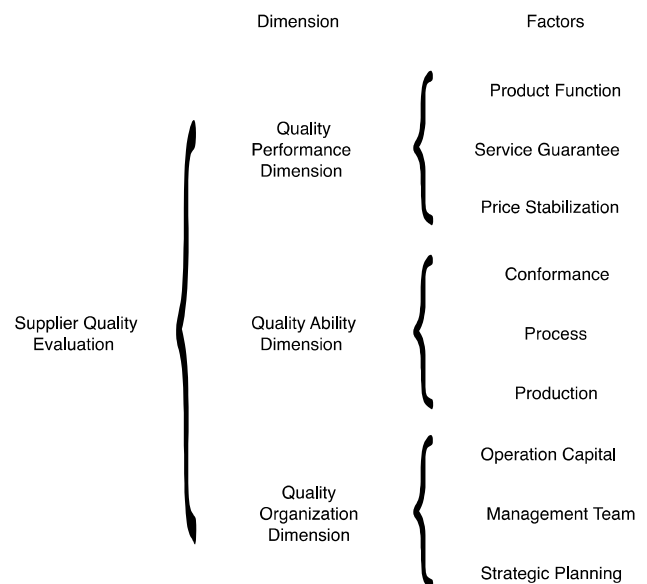
Figure 2. The supplier quality evaluation dimension and the content.

customer. Price stabilization is the factor considered from the expense. In quality ability dimension, the conformance is the measurement of the effectiveness above. And the process factor is the measurement of the efficiency and adaptability. The production factor points to the total produce guarantee ability, including safety production, field management and so on. In the quality organization dimension, the operation capital, management team and the strategic planning is the considering factors.