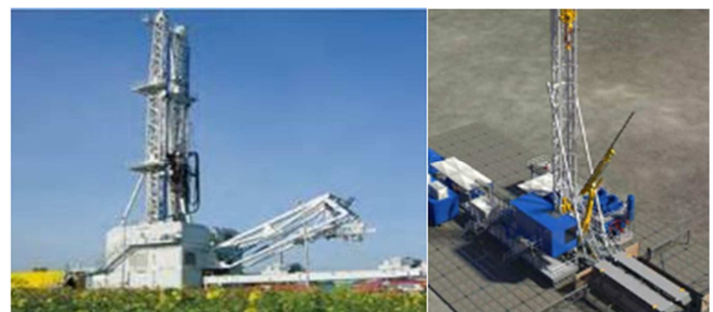
Figure 5. Turn-over automatic pipe picked-up and laid-down drilling floor device.

These automatic picked-up and laid-down devices have their own characteristics, which can improve the safety performance of field operation, reduce the time of pipe pick-up and laid-down drilling floor, and improve production efficiency. But a common disadvantage in these automatic pick-up and laid-down drilling floor is only suitable for a certain type of rig or a certain height of rig. For different drilling floor layout, height and wellhead center distance, a