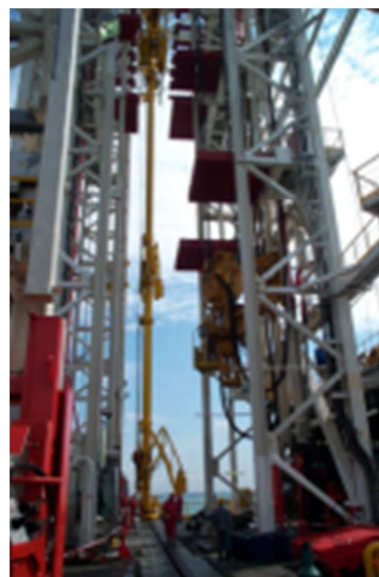
Figure 10. Grab-type pipe handling device.