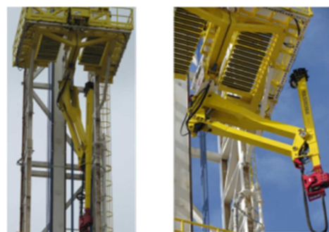
Figure 12. Automatic pipe handling system on racking board.

In recent years, a new type of racking board pipe handling device [17] (Robot Derrickman) has been introduced abroad. The device (Figure 12) makes use of industrial robot technology, and the automatic derrickman can be installed on double or triple rigs with only a slight change to the racking board. It is suitable for land rigs and smaller offshore drilling with handling all kinds of stands from 2-7 / 8 "to 8-1 / 4" and the maximum weight of 6800kg.