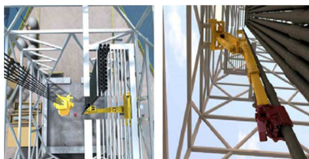
Figure 11. Suspension-type pipe handling device.

These automatic pipe handling devices all have good effects when they are used in new drilling rigs, but the high cost, the heavy workload of the retrofitting and poor safety and reliability are shown when it is used for the retrofitting of servicing drilling rigs.