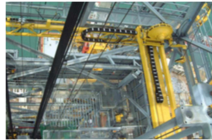
Figure 13. Offline stands building device of the National Drilling Company.

Recently, the National Drilling Company adopted an automatic pipe handling system and an offline stand building device for drilling operations on an artificial island (there are nine rigs). The offline stand building device (Figure 13) is a simple and applicable crane. By installing an elevated gantry over the racking board, the stands can be built and supported simultaneously without interrupting the wellhead drilling operation. The crane composed of three parts (bridge, pulley and beam) is composed of two special main beams, which provide support and slide rails to cross the bridge horizontally above monkey board. The pulley crosses the bridge horizontally and lifts the stands with hydraulic winches. The combined movement of crane and bridge moves the stands to the storage position of the setback box or finger beam. The offline stand building device also includes two revolving rat holes, a base type of iron roughneck and a power catwalk.