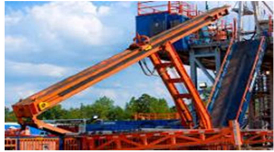
Figure 2. Lift automatic catwalk.