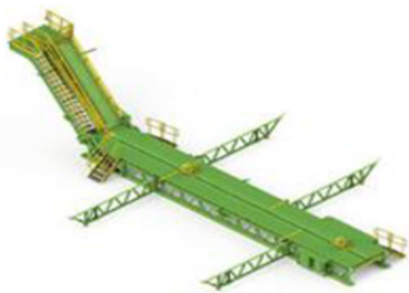
Figure 1. Fixed automatic catwalk.

Automatic Pipe handling system mainly includes two parts, one is picking up the pipe from the ground to the drilling floor or laying down from the drilling floor to the ground, and the other is the pipe handling on the drilling floor. At present, there are fixed power catwalk, lifting power catwalk, parallel connecting rod power catwalk and overturning manipulator (Figure 1 to Figure 5) [6~10], which can transfer drilling string (drill pipe, collar and casing, etc.) from the ground to the certain position on drilling floor or from drilling floor to the ground pipe rack. Only a small number of personnel or no manual assistance is required. Some of these automatic picked-up and laid-down drilling floor devices have been used on fully automated rigs, and most of them can only be used on semi-mechanized and semi-automated rigs, or for the retrofitting of servicing rigs. These devices can also measure, record and calculate the length of drill string automatically by infrared ray at the same time. They can be operated by remote control or by manual touch screen in driller's control room. The labor intensity of field workers can be greatly reduced, the safety and efficiency of pipe handling can be improved, and the drill pipe joint thread is also protected.