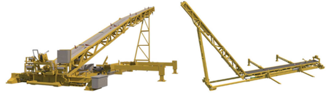
Figure 6. Multifunctional automatic pipe picked-up and laid-down drilling floor device.

angle of the pipe entering the drilling floor. It can not only transfer drill pipe, collar and casing between the ground and the drilling floor, but also can safely and effectively transfer various drilling floors and downhole tools, such as casing pliers, stabilizers short joints and bits by using the integrated telescopic manipulator.