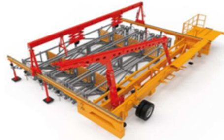
Figure 3. Parallel connecting rod power catwalk.