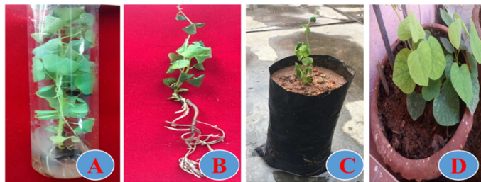
Figure 3. A. Rooting of in vitro regenerated shoots on MS Medium supplemented with IBA at 1.0mg/l & NAA 1.0mg/l; B. In vitro regenerated micro shoots with roots ready for hardening; C. Plantlets kept in poly bags for hardening in greenhouse conditions; D. Hardened Plantlets transferred to earthen pots having soil and vermiculite in 1:1 ratio.

Data represent treatment means ± SE followed by a different letter (s) within a column indicate significant differences according to ANOVA and DMRT test (P< 0.05).