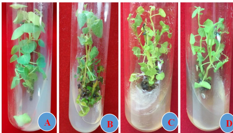
A. MS+3% Sucrose B. MS+2% Fructose C. MS+4% Maltose D. MS+4% Glucose.

Data shown treatment means ± SE followed by a different letter (s) within a column indicate significant differences according to ANOVA and DMRT test ( P < 0.05 ).