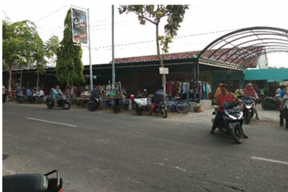
Figure 1. Picture of Panempan Village Market before and after managed by BUMDes

Then on November 6, 2017, a Village Deliberation was held to form a Village-Owned Enterprise (BUMDes) under the name BUMDes Delta Mulia, which was followed up with the issuance of Village Regulation No. 02 of 2017 on November 13, 2017 concerning the Establishment, Management and Management and Disbanding of the Village Owned Enterprises