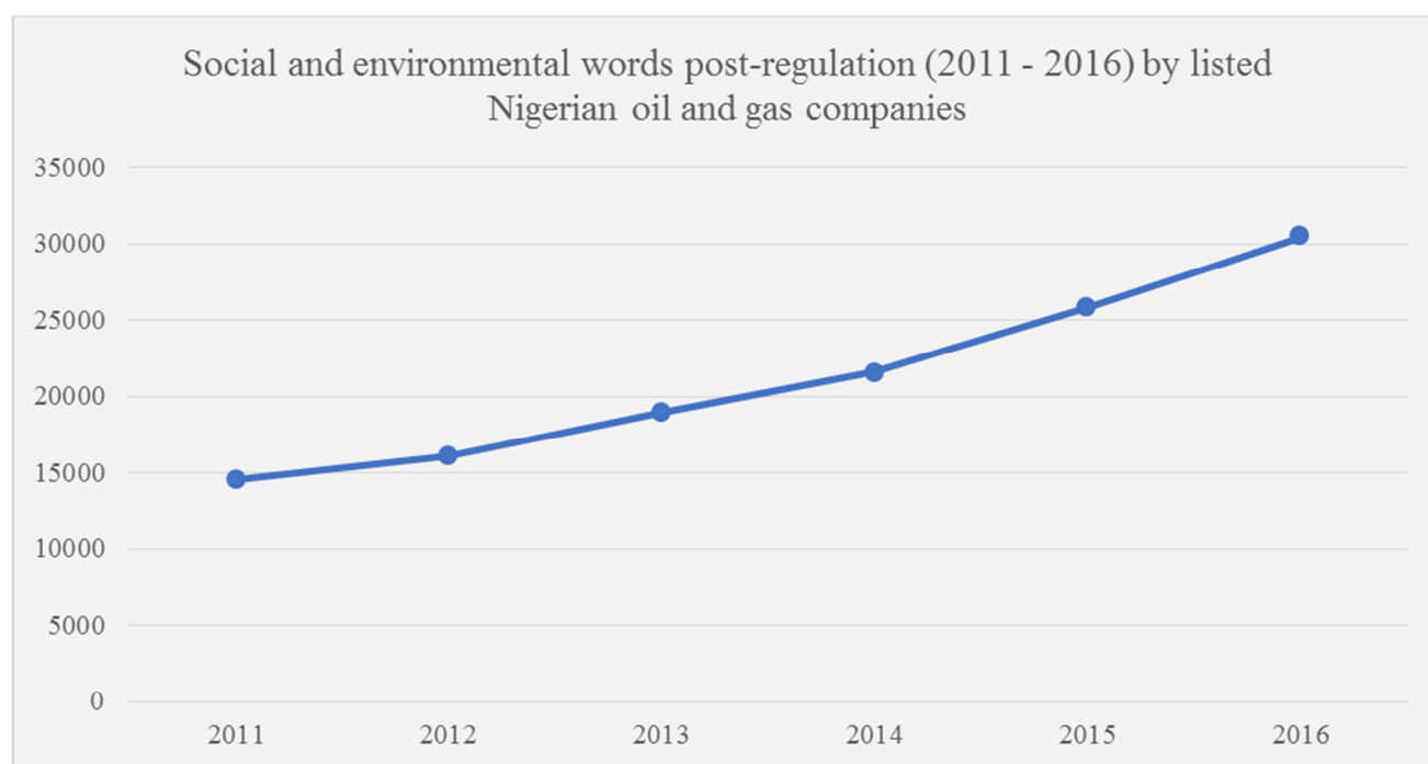
Figure 2. SED six years post-regulation 2011 – 2016.