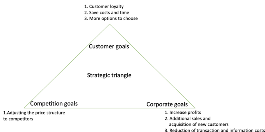
Figure 1. Goals of price differentiation.

Pricing is considered a classic marketing activity because