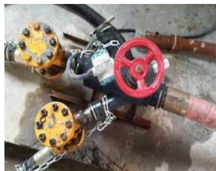
Figure 2. Free ball check valve mixing device.

(1) During the grouting period, the steel ball in the one-way valve vibrates and rotates under the action of fluid, which can effectively delay the solidification of the slurry. The process performance is good, and it realizes automatic control without manual operation and eliminates safety hazards. (2) The free ball check valve is simple in structure, easy to install and maintain, and closes tightly under the back pressure of the slurry after stopping the pump; (3) During the grouting operation, the pump can be stopped at any time when the number of grouting pumps is adjusted or the grouting pump is repaired, which does not affect the operation of other grouting pumps, avoids unplanned stopping of grouting, and improves the grouting efficiency and grouting quality. (4) Before stopping the pump, only the single-pass grouting pipeline of the front system of the mixing device needs to be cleaned for no more than 2 minutes, which has little effect on the slurry concentration; (5) The pressure relief valve is installed to relieve the pressure of the grouting system in sections, which enhances the safety of the grouting system.