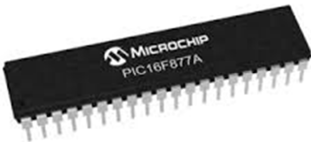
Figure 5. PIC16F877A.

PIC16F877A was decided to uses in this project, because it had 256 bytes of EEPROM Memory, which the memory that