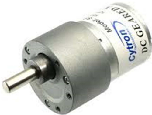
Figure 4. DC Geared Motor SPG30-20k.

The locomotion of the Elbow Joint Rehabilitation Device was achieved by utilizing DC geared motor. The model was use is SPG30-20k, which bought from Cytron Technologies. The rated voltage is 12V, with the flexible speed at 185 RPM.