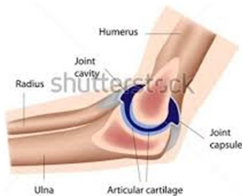
Figure 1. The structure of the elbow joint.

The elbow joint is a complex hinge joint formed between the distal end of the humerus in the upper arm and the proximal ends of the ulna and radius in the forearm [8], [9]