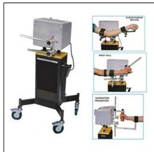
Figure 3. Continuous Passive Motion Unit CPM (Elbow).

Range of Motion (ROM) Settings for this unit are Programmable from 00 to 120\text{deg} for Elbow movements, which it can be control the range of motion for our elbow. This unit is