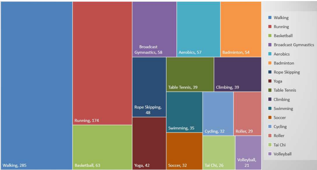
Figure 3. Statistical Diagram of Daily Physical Exercise Project of Postgraduate Students.

The results of the above survey on postgraduates' physical exercise load show that: the overall physical exercise of Chinese postgraduate students are in the current situation of low exercise frequency, short exercise duration and small exercise intensity. This condition can not promote the physical health, mental health, social health and the overall health of postgraduate students. Therefore, the corresponding measures must be taken to standardize and promote postgraduate students' physical exercise.