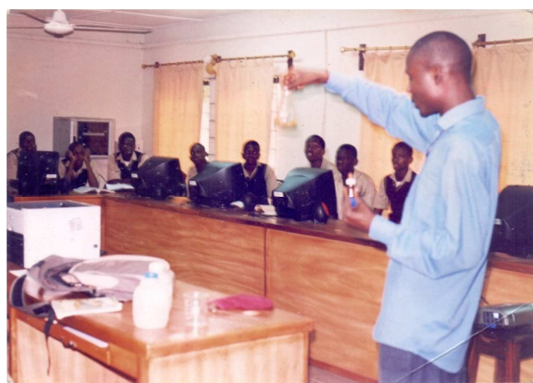
Figure 1. The researcher explain what the students had seen in the virtual laboratory using the real laboratory apparatus.

* The experimental group was exposed to instruction in practical chemistry through virtual laboratory and conventional method of teaching through the real laboratory. The students in the experimental group takes the instruction the conventional way in the real laboratory from their teacher and the teacher is also present during the virtual laboratory instruction the teacher joins the researcher. During the virtual laboratory instruction, students were also exposed to the demonstration of activities done in the real laboratory as shown in the picture in figure 1-3.