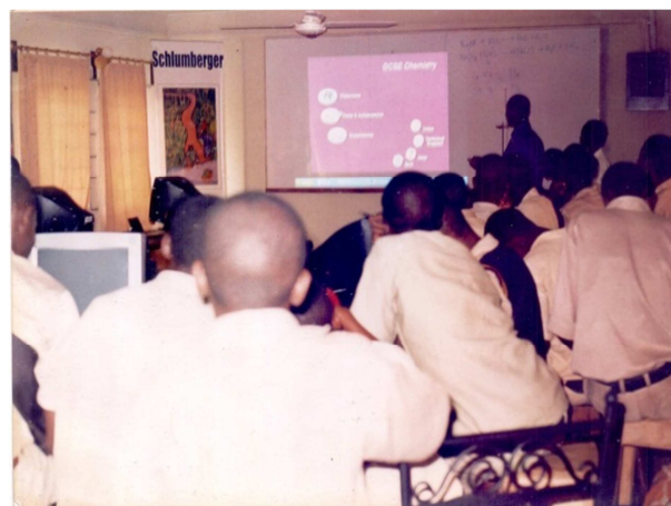
Figure 3. Students in the experimental group watching the virtual laboratory projections.

** The students in the control group were exposed to conventional instruction in quantitative analysis in the traditional laboratory; without virtual laboratory instruction.