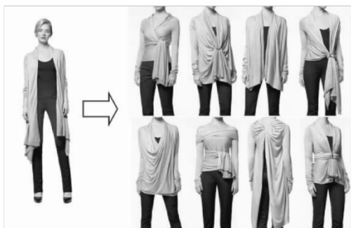
Figure 4. Donna karan design of DKNY Cozy.