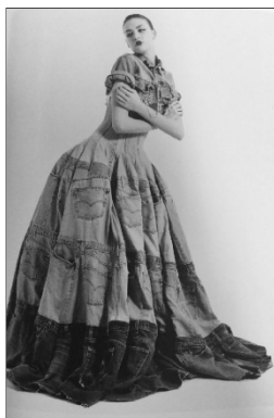
Figure 2. Gary Harvey design of recycled denim skirt.