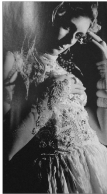
Figure 1. designer Rachael Cassar dress design.