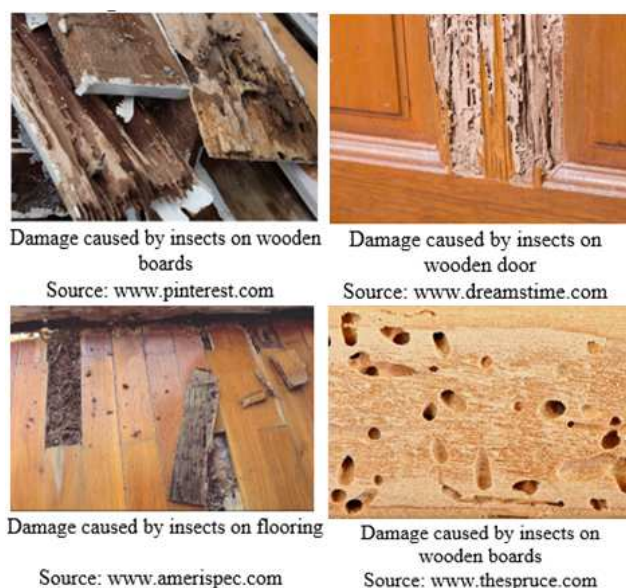
Figure 3. Shows the effect of insects' attack on wood and wood products.