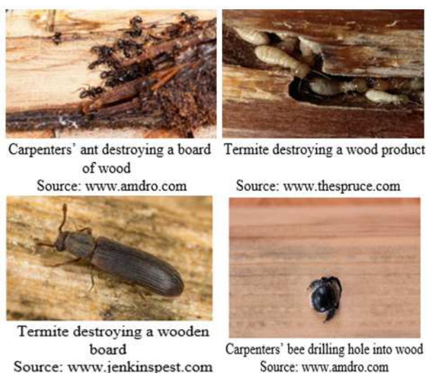
Figure 2. Shows some common wood-destroying insects attacking wood.

roofs, sinks, bathtubs, and chimneys. It is very difficult to see with the naked eye, but the homeowners can see lots of pieces of wood and sawdust around the area, both of which are signs of ants.