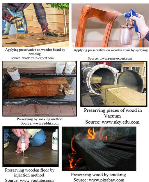
Figure 4. Shows the conservation processes of wood and wood products.

As instructive research, the authors recommend to other researchers for further studies to be done by singling out each