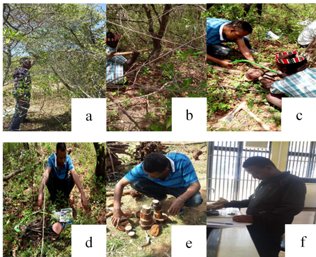
Figure 1. Photographs of the Osyris plant harvesting.

(a) multiple stem plant being measured for breast height diameter; (b) tree cutting for biomass (c) biomass component being portioned: stem, branch and foliage and sample discs cross-cutting (d) partitioned of biomass component and disc being taken from stem; (e) discs arrangement for ring determined (f) dry biomass weight at laboratory