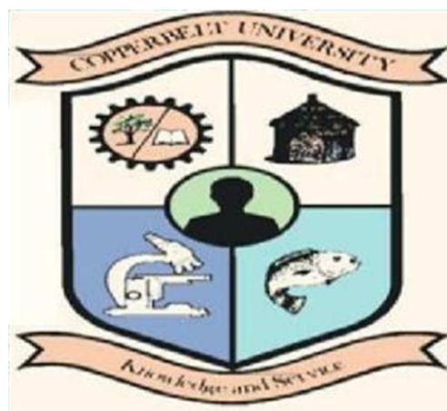
Figure 2. The Copperbelt University Logo.