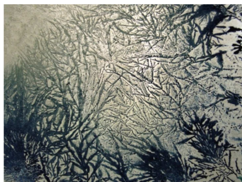
Figure 2. The crystals formed after drying an aqueous solution of \text{CuCl}_2 , through which a direct current of 10 mA was passed for 10 minutes.

In the course of numerous experiments, it was found that tree-like crystals are also formed during the drying of various aqueous solutions of chlorides, through which short-term constant electric currents flowed (Figure 2).