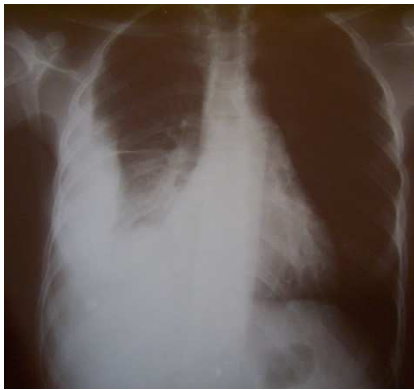
Fig 3. chest radiograph showing a right pleural effusion of moderate abundance without intra parenchymal infection.

The patient had first undergone a chest X-ray (Fig 3), which showed a right moderate-sized pleural effusion.