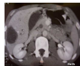
Figure 1. 2a. 2b. Axial CT scans without (Fig1) and with injection of contrast material (Fig: 2a,b) showing cystic formations including one in segment IV containing peripheral calcifications and fistulized in the intrahepatic bile ducts which are dilated.