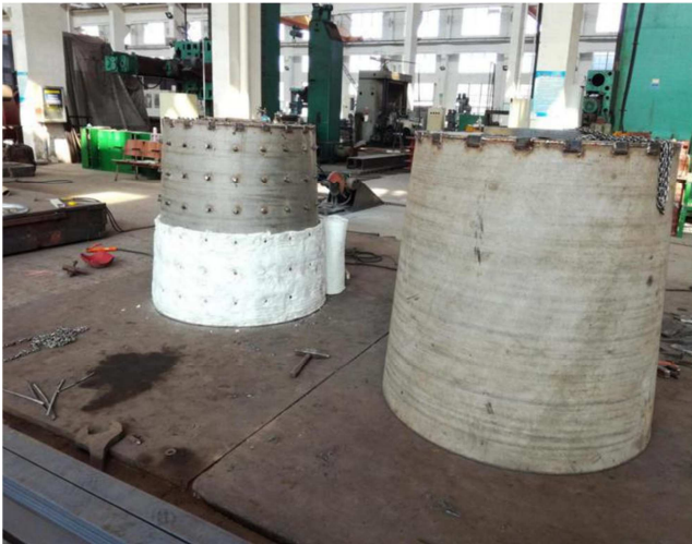
Figure 2. The inner and outer layers of vacuum liner.

Stainless steel plate was chosen to weld vacuum chamber. Considering problems such as atmospheric negative pressure, hydraulic pressure of molten steel and the thermal deformation when used at high temperature condition, some measures were taken to prevent mechanical deformation and increase heat preservation property. All welds at the force points were in flared - bevel grooves. Large curved surface