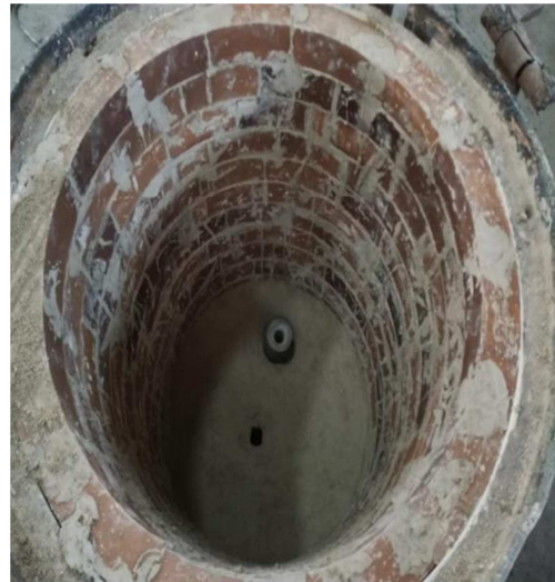
Figure 4. The insulation layer and the fire-proof wall.