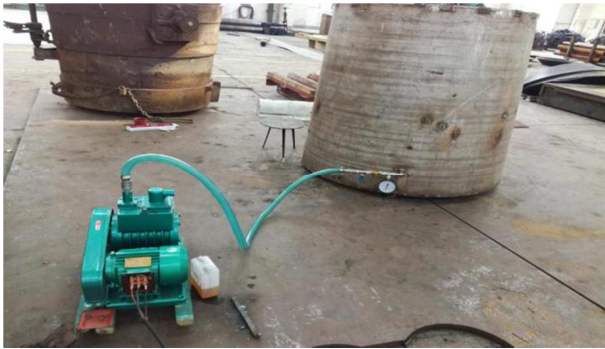
Figure 3. The test of sealing property of vacuum room.