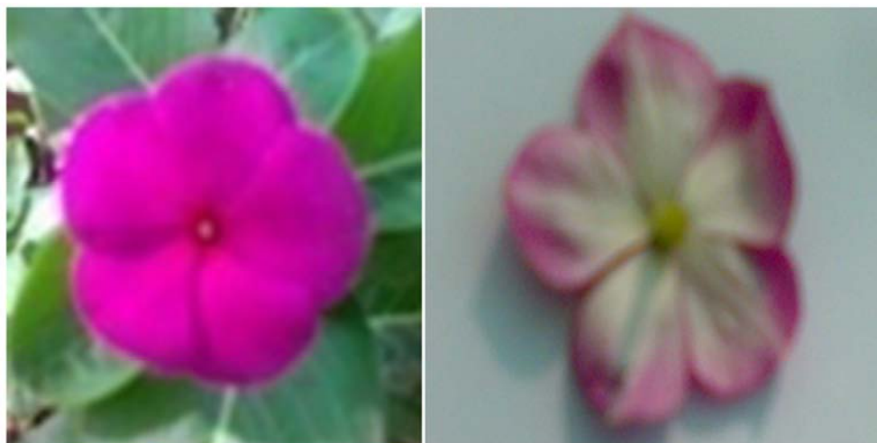
Figure 4. Face and back of violet flower colour parental (V).