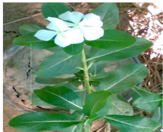
Figure 2. W(White) white lobe colour and greenish white eye.

In this paper, the two stocks of parental strains were raised in pot. Two to three seeds was put in each pot and later thinned to one seedling per pot.