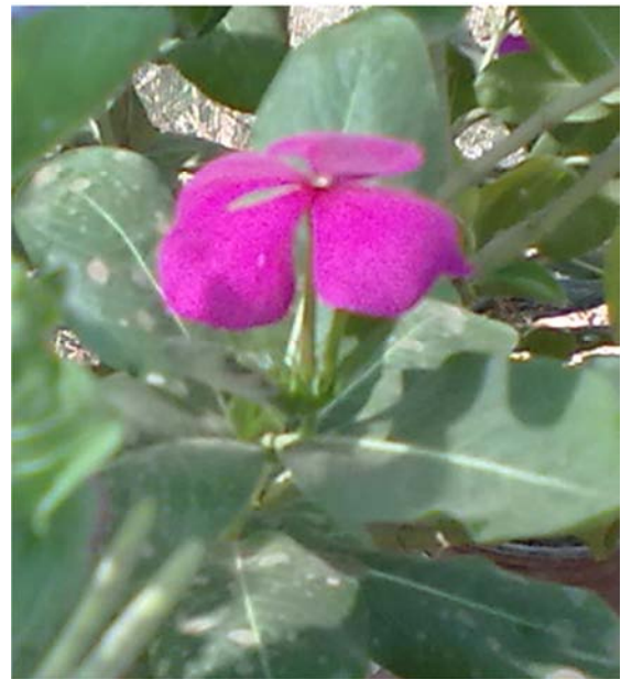
Figure 1. V(Violet) violet corolla and purple violet eye.

The source of seeds for the two parental strains of periwinkle ( Catharanthus roseus ) plants with two different flower colour were used in this study violet (V) and White (W) color Figure 1, and Figure 2 were obtained from lants growing naturally in the University lawns (University of Kassala). in Sudan, Kassala state, Department of Chemistry and Biology at the Faculty of Education.