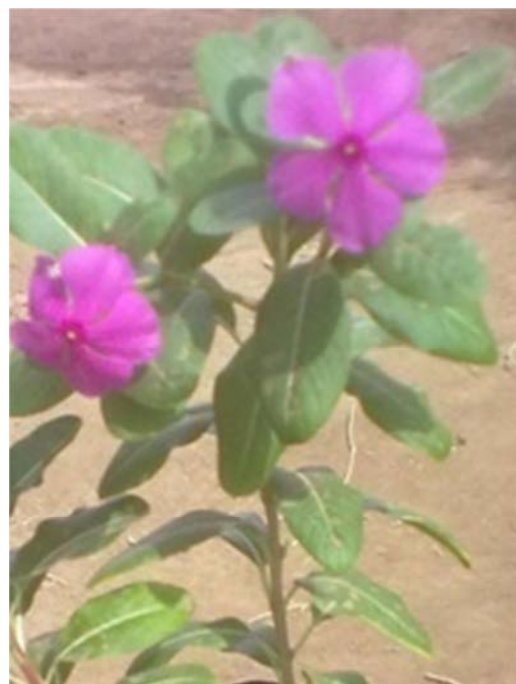
Figure 3. slightly light violet flower color in (F1) plants plate.