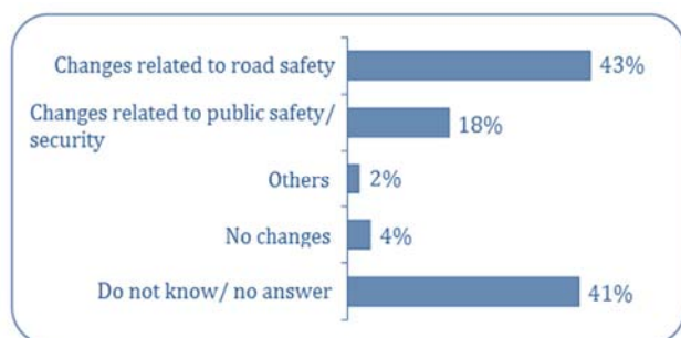
Figure 2. Changes that would be performed in the city to make it safer for children.

Most of the children states also that, to feel safer in their city, it should occur changes related to road safety (43%), most notably greater respect for traffic rules (9%), to reduce traffic (8%), to install more lights (6%) and to make more parks and playgrounds for them (6%). This data is contained in the Figure 2.