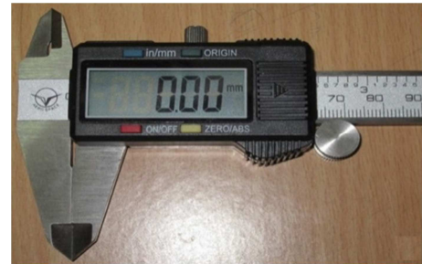
Figure 1. Vernier caliper.

for quantitative variables and were summarized by frequency (percentage) for categorical variables. The correlation of variables was tested by correlation analysis and backward regression analysis was used for prediction penile length and circumference. For the statistical analysis, the statistical software SPSS version 16.0 for windows (SPSS Inc., Chicago, IL, USA) was used. P values of 0.05 or less were considered statistically significant.