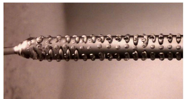
Figure 4. Virtue sirolimus-eluting angioplasty balloon with precise micropores [36].

Design of the Virtue sirolimus-eluting angioplasty balloon (Caliber Therapeutics, New Hope, Pennsylvania) is completely different from the above-mentioned sirolimus DEBs [35]. It combines a promising approach involving encapsulation of sirolimus in submicron particles with angioplasty without a balloon coating (Figure 4). Thus, a liquid formulation is delivered through precise micropores in the balloon concurrently with angioplasty [36]. In a single-arm feasibility study at 9 European centers, 50 ISR patients were treated with the Virtue balloon. The in-segment late lumen loss at six months was 0.31\pm 0.52 mm. The MACE rates were 10.2% and 14.3% at six months and one year, respectively, underscoring the need for further evaluation of dedicated randomized studies.