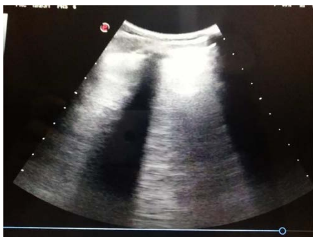
Figure 2. Lung ultrasound shows B-lines.