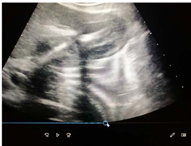
Figure 3. Gastric ultrasound showed a cross-sectional area of antrum was 3 \times 3 cm.