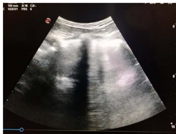
Figure 4. Multiple B-lines.