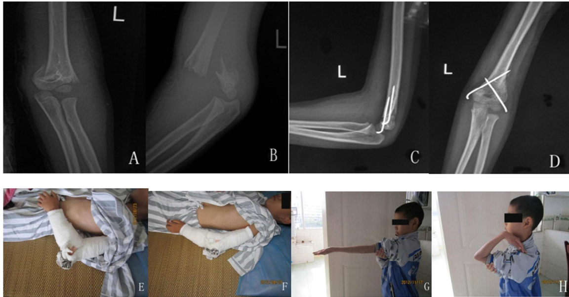
Figure 1. A patient in the intervention group diagnosed with left Gartland type III SHF. X-ray images of patient's elbow before (A and B) and after surgery (C and D). Patient was given post-surgery FTFAEF (E and F). Elbow function was assessed at 2 months post-surgery (G and H).