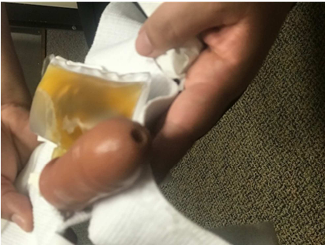
Figure 2. Small plastic bag with fake urine connected to rubber penis.