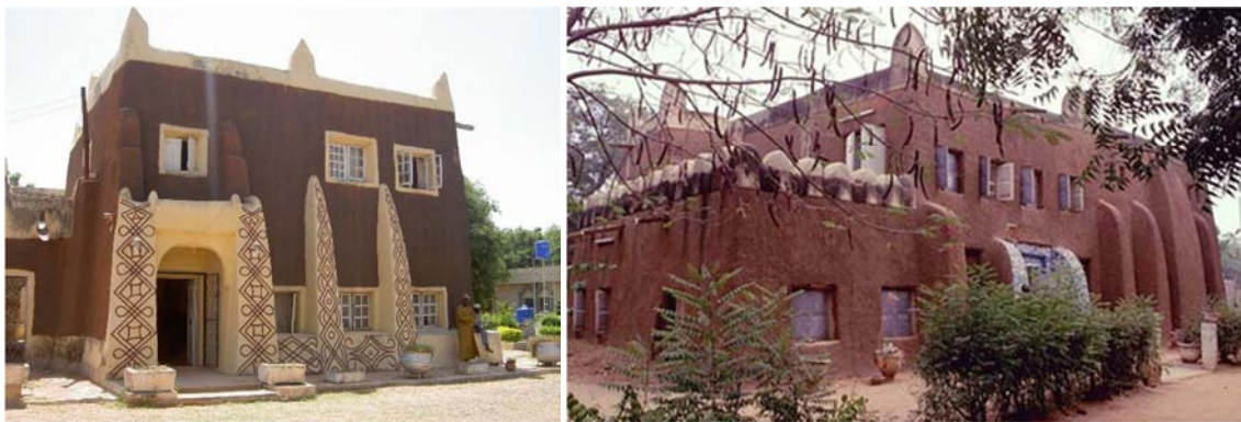
Figure 1. Shows Hausa traditional buildings

Hausa people in the northern part of Nigeria have