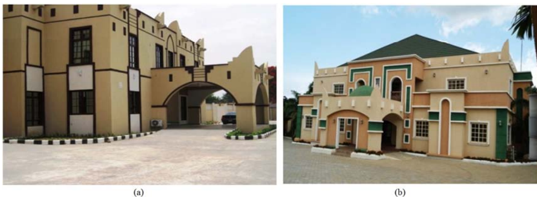
Figure 3. Shows Hausa revival architecture Source: [1].

physical prestige of the early 20 th century [14]. The models symbolized the dominance of previous culture as well as the old technological design approaches [9]. “Although the popularity and indeed, many qualitative meanings attached to it varies from one particular period to another and differed from one kind of region to another” [1]. Therefore, the movement “architectural revivalism” has no general supported theory of codes, the revivalist designers built-up base on the characters of the old built context and the accepted practice. The attitudes create differences due to initial class and the usual general characteristics [14, 9]. However, as in Hausa communities of northern Nigeria the approach termed, “architectural revivalist style” ordinarily means contemporary designs that consciously displayed historical built elements as well have some gestures towards the old designed characters [13, 14]. As such, the approach is one of the sources of knowledge in the current returns of memorial design concept, and it is important to both public and residential buildings that created continuity in built form and structure, as well as to the recalls of the preexisting perceived designs [1].