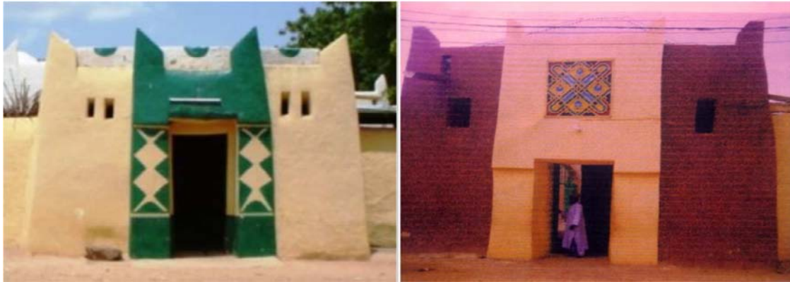
Figure 2. Shows Hausa traditional façade decoration, engraved surface with pinnacles (Zankwaye). Source [12].

actually valued culture and tradition that is inherited in climatic, socio-economic as well as local ways of signaling the social systems [22, 2].