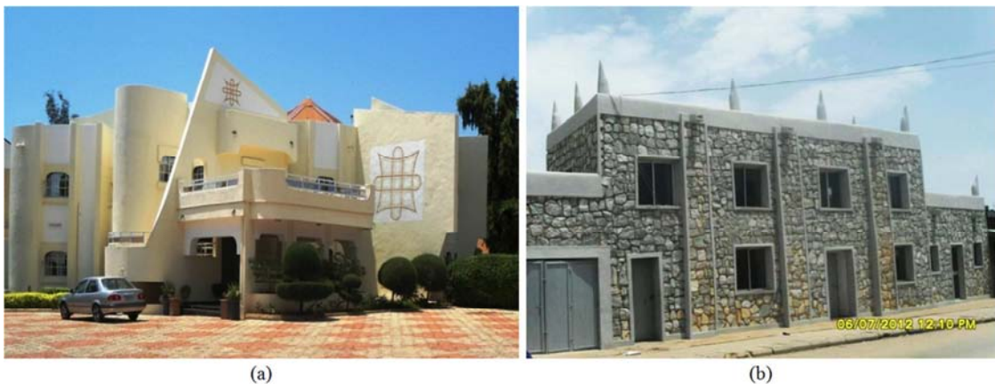
Figure 6. Shows Hausa revival architecture Source: [1].

Similarly, Jencks [14] noted out that if time and usage are the crucial variables in architectural meaning, the case of straight revival becomes a problem. The design in figure 6b expresses an abstract reflections of Hausa architectural identity. As it stands, the building fits into the regional architectural character and represent a synthesis of dialogue between the new Hausa style and the previous traditional fashion with regional architectural identity at a glance. Indeed, it is a single coded design with cultural and traditional architectural meaning. The ideal nature of the design is obviously meant to relate the building to its local milieu. The used of the flat roof, the masonry work, and the pointed pinnacles (Zankwaye) gives the design a reflection of its real identity that was rooted in historical precedents.