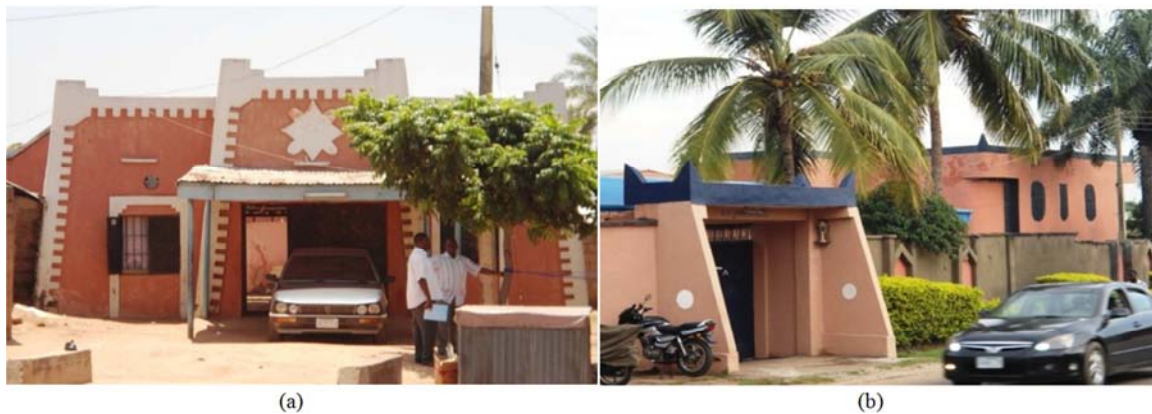
Figure 4. Shows Hausa revival architecture

community in northern Nigeria. The building is neither a creative social extension to tradition nor clear expression of semiotic balance for its place within a system of meaning [14]. The variety of codes used in the design seems appropriate for aesthetic revival. The built features, such as the entrance porch that is crowned with a dome and the pointed pinnacles (Zankwaye) on the parapets which signified a real Hausa building that fits to its context in both language and scale. The design not only went back to the traditional fashion, but also adopted the manner of regional social balance. Accordingly, reasonable architecture must have a signifying reference, the contemporary designs in figure 3 are more of traditional designs in their physical appearances, the imitations of the traditional beams (Azara), the arches, parapets, and the whole compositional features are purely Hausa in their architectural suggestion. These indefinable built elements are convincingly adopted from historical sources which also represent a symbolic connection between the old and the new Hausa design systems.