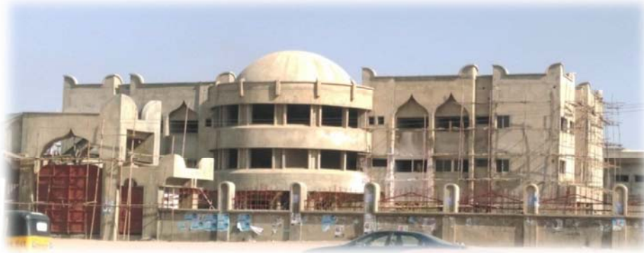
Figure 7. Shows Hausa revival architecture

particular identity that originated from particular culture. The cultural symbolism attached to the designs defined the value system and the beliefs of Hausa people. It includes not only the intellectual art of the Hausa folks, but encompasses the shared societal cultural belief that house should have a flat roof with parapet (Rawani) and pinnacles (Zankwaye). They are exceptional outstanding architectural models copied from Hausa traditional domestic buildings with cultural manifest. The whole complex distinctive models displayed cultural symbol, progressive belief, and cultural identity.