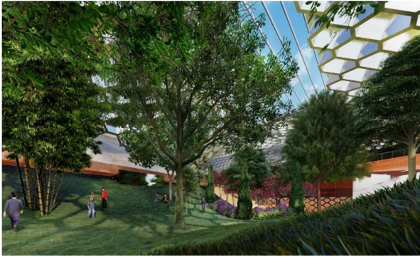
Figure 5. Public Space.

While the use of space application in this building is almost more than 60% of the space used for spaces that are open so that the land used for building mass is only 40% but has a good quality of space.