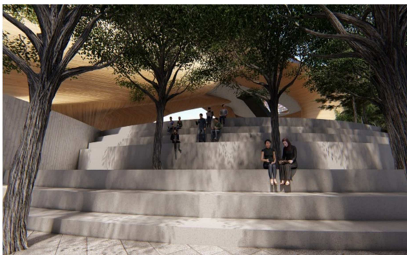
Figure 6. Common Space.

The outer space directly adjacent to the Kedung Baruk Highway protrudes into 15 meters because it responds to the planned widening of the Kedung Baruk Highway. This public space is equipped with hardscape elements such as pedestrian, artificial lights, fountains that also function as transparent barriers from roads, amphitheater, park benches, children's games, fitness equipment for the public, etc. In addition there is a softscape in the form of native or synthetic garden grass, several shade-titled trees that are equipped with hanging plants, and a row of tropical plants on the side of the seating and pedestrian. Overall the outside space is almost parallel and blends with the mall's ground floor in the hierarchy.