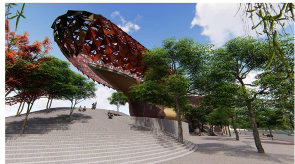
Figure 4. Open Amphitheater and open space.

The exterior appearance of the building uses polished copper-colored panels that are fabricated to the appropriate grid size. Each grid has a different angle so it will produce a dynamic reflection. When the afternoon will be flat forming highlights and shadows that will add depth and an attractive appearance. In the Northern hall of the Shopping Center building there is a public space resilient space that can be used by the community to just sit and enjoy the afternoon after work or college, morning exercise, to the gathering point of the community gathering on weekends. An outdoor space provided for the public which is open 24 hours.