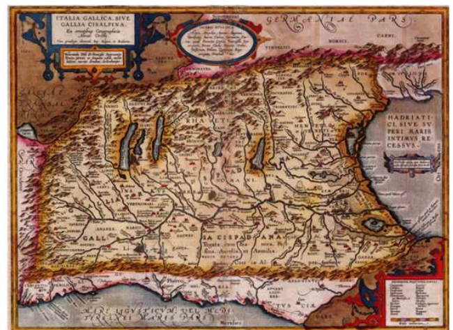
Figure 4. Gens Cassia or rather Gallia Togata

Essentially, the pre-roman country was organized to equidistant points located at a distance from each other always between 30 and 35 km (example: Cavaglià <= 29 km => Vercelli <= 35 km => Vigevano <= 30 km => Milan (Duomo) <= 29 km => Cassano d'Adda <= 31 km => Urago d'Oglio (location called Montagnina dei Frati) <= 31 km => Brescia). The "castles", later called Castrum , for the protection of the points of tolls collection, were usually placed exactly in the middle and - in the area between Bergamo and Brescia - the town called Castrezzato is an example. Throughout the country of the gens Cassia was organized on this pattern: we can mention as further example, the route Milan - Avignon, itinerary, which shall remain in use until late 1500: Milan <= 30 km => Vigevano <= 35 km => Casale Monferrato <= 35 km => Asti (roman "Municipium" known as Hasta Pompeia) <= 30 km => Chieri (the Roman toponym of Carrea Potentia, handed down by Pliny the Elder) <= 35 km => Avigliana (in Latin Villiana which was, in Roman times, the boundary between the ager taurinensis, point of toll collection called quadragesima galliarum, namely the toll on goods coming from Gaul).