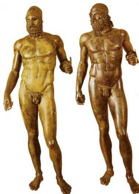
Figure 2. Riace bronzes

A story that is summarized in statuary but similar in potteries or in a contemporary crater, now in the Louvre where we see Castor with helmet and horse, and by side, the Etruscan wheel is represented, also in St. Peter's (Montelupo Fiorentino, at confluence Arno and Pesa river). Remaining examples of columns engraved with horses are in the cathedral of Lodi. Symbols which, in more territories to the North, will change a little bit: a God with the wheel that rolls, as in the Jupiter Column (Jupitergigantensauale). The pillars depict the victory of Jupiter Optimus Maximus over the forces of Chaos, the god himself being raised high above the other gods and humankind, but closely linked with them.