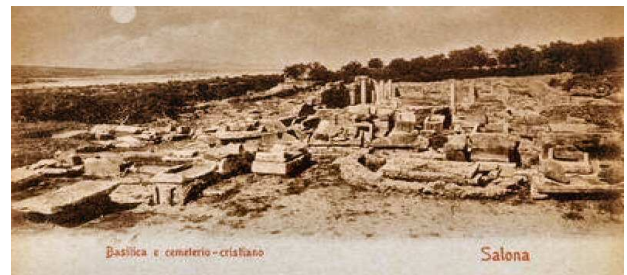
Figure 1. Salona, Garda lake

First inhabitants of Rome were divided into several tribes (Gaul) and converged on what would be later called as Campus Martius for certain ceremonies or rituals and to discuss and elect leaders. It was forbidden to address issues of common interest other than in public meetings. These places were called "septae" and still today, it is said to be "divided into seven". Architectural items remain: elliptical corrals where they could vote and pray to the ancestors as tutelary deities. This was a common practice throughout Italy, and we find these same toponyms in many Italian regions (toponyms beginning with sett* , sezz* , sep* , ses* , sit* , sis* , sed* , sal* , sap* , seq* , sib* , equ* , acq* , cav* , bri* ) because in all these places, public meetings were held and equitable judgements were taken on those who had done wrong. Near a toponym br* there's always one of these toponyms seq* , sep* , etc. for the public meetings: e.g. in France Séqué near Biarritz ancient Bearritz. And near Brescia was the ancient Salona (now Salò).