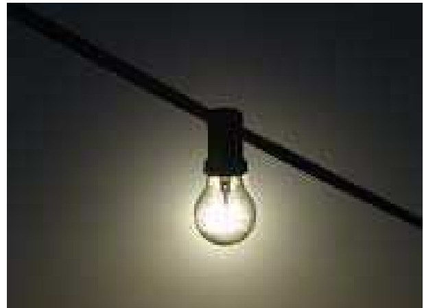
Figure 4. Increasing ZLD's perimetric darktomic density.

within a vast sea of darkness. ZLD has increasing diatomic concentration (density) towards its periphery that blends imperceptibly to the unilluminated perimetric darktoms (see figure 4).