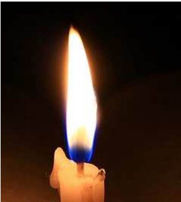
Figure 3. A candle light sculpting its shape in the dark.

When light shines in the dark, it sculpts the shape of its source in the vast sea of darkness (see figure 3).