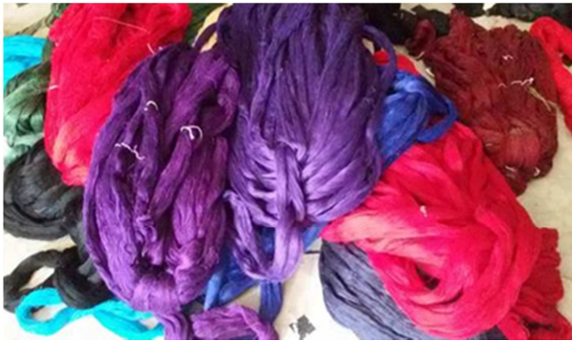
Fig. 8. Raw materials like Matka, Wool, Linen etc.

From the above discussion, it is crystal clear that the present condition of the handloom industry of Fulia is not satisfactory and this industry is now oppressed by different problems.