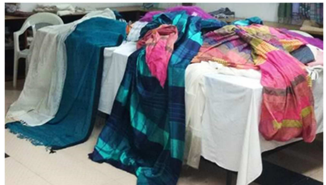
Fig. 7. Different types of Exportable clothes made in Fulia.

These sharis are of very simple designs and patterns and need not to starch. Not only co-operative members but also many weavers are now weaving this newly invented Tangail Shari .