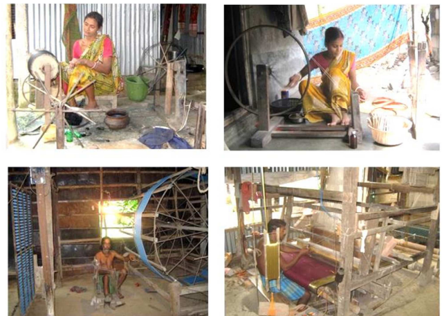
Fig. 4. Different stages of weaving Tangail Shari.

At present, though there are many societies but only three societies play a vital role for the development of this industry. These societies not only produce Sharis but different exporting products also i.e. Scarves, Stoles, Made-ups, Dress-materials etc. since 1985. These various kinds of cloths are weaved by using different fibers like cotton, silk, wool, linen, tussar, muga, matka etc. These all productions are exported in different countries of the world like Japan, Germany, Italy, USA, Denmark, French, Switzerland, Australia etc. through Merchant Exporter.