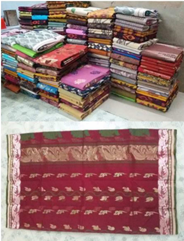
Fig. 5. Traditional Tangail Shari.

From the above table it is noticeable that though above mentioned Co-operative societies no. 2 and 3 respectively have fewer handlooms; selling amounts are high, as these two societies produce exportable clothes. This export clothes production business is increasing day by day and spreading among the private traders and individual weavers as well. The sharis are exported to different cities of South India like Hyderabad, Secunderabad, Vishakhapatnam, Bijaywada, Bangalore etc. Nowadays, a new type of Tangail Shari has been invented by the handloom artisan-members of Tangail Tantujibi Unnayan Samabay Samity Ltd. known as Non-Traditional Tangail Shari which is based on Tangail Gharana but other than Tangail Shari .