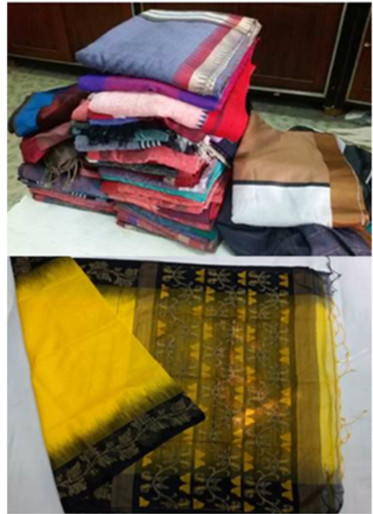
Fig. 6. Non-Traditional Tangail Shari.

These sharis are of very simple designs and patterns and need not to starch. Not only co-operative members but also many weavers are now weaving this newly invented Tangail Shari .