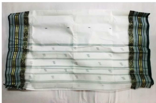
Fig. 2. Traditional Tangail Shari.

Before the discussion of the Tangail Shari of Fulia, it is necessary to discuss about the origin and the history of this Tangail Shari . The Tangail Shari seems to be incomparable to the Santipuri Shari regarding to age. Probably hundred years ago, at the last decades of nineteenth century this shari was evolved in Tangail of undivided Bengal. The weavers of this Tangail Shari are the successors of the famous Muslin weavers. The weavers of Dhamrai of Dhaka and adjacent Chowhatta came to Tangail and its adjacent twenty two villages by getting invitations from the Jamindars of Deldwar, Santosh and Gharinda [2]. At first they weaved only thann and cloths of turban. Then in the year of 1880-85 they had begun to weave sharis . After that in 1923-24, the design in the shari had been started and in 1931-32, Jacard Machine was introduced for this purpose [5]. During the partition in 1947 and the freedom war of Bangladesh in 1971, the Tangail weavers came to West Bengal as refugee and most of them were settled at Fulia of Nadia District and Samudragarh of Burdwan and some were settled at Dhatrigram of Burdwan and Nabadwip of Nadia.