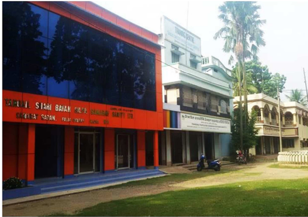
Fig. 3. Samabay Sadan (Co-operative Societies of Fulia).

Hence, the desired development of this industry happened from 1980. This development becomes possible not only for the Co-operatives but for the individual venture also. At present, this handloom industry is well appreciated in our state as well as in India and worldwide.