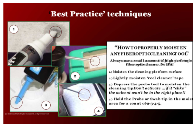
Figure 4. Debris is attracted to moisture. A measured amount of fiber optic grade cleaning fluid leads to enhanced cleaning of most popular tools.

Inspection studies performed using digital photography confirmed there is ‘primary’ debris as defined by IEC 61300-3-35, but also “secondary contamination” not considered as it is not viewable by existing microscopy and current understanding as fostered by standards that are ‘minimum requirements’ to assure best practice transmissions. [22].