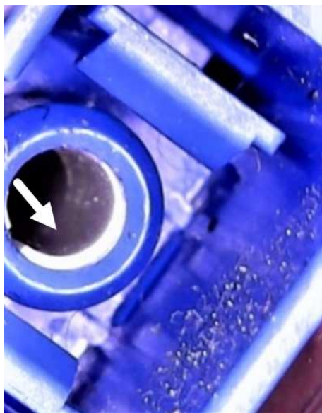
Figure 2. Alignment sleeves are source of potential cross contamination and are not characterized by existing standards.

As well, defined in Figure 2, adapters connection adapters and alignment sleeves are often not studied and the potential source of 'cross-contamination'. Unseen debris is present and 'pointed'.