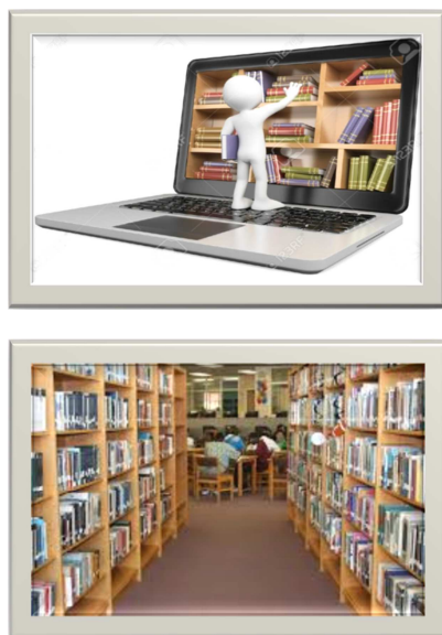
Figure 3. Examples of traditional and electronic library.

Certain resource storage areas of traditional libraries are limited. While, electronic libraries have a high potential to store large information, and are relatively simple due to the electronic data, which occupies very little space. Thus, the cost for the maintenance of electronic library may be significantly reduced compared to traditional library. Both types of library require the cataloging of information. The examples of traditional and electronic library are shown in Figure 3.