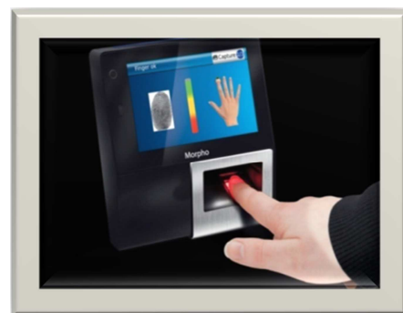
Figure 4. Fingerprint identification.

Examples of fingerprint identification is shown in Figure 4.