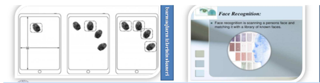
Figure 6. Example SDLAS.