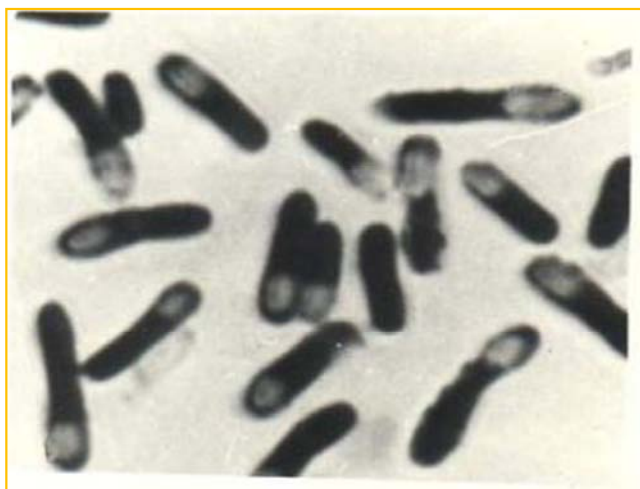
Figure 2. Spores of Clostridium Botulinum .