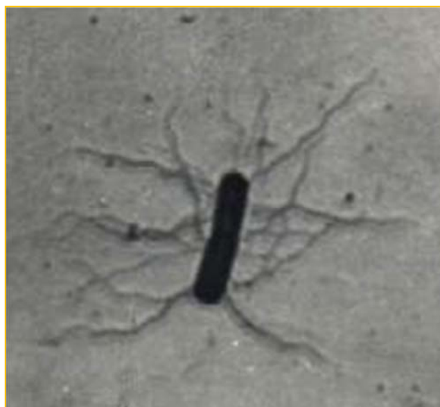
Figure 3. Morphology under electron microscope.

There are many factors influencing the prevention and control of large-scale rodent control, and the palatability of the rodent to the drug is also a key factor. In this experiment, We improved the palatability of rodents on drugs through the improvement of bait formula. The choose palatability is good of wheat bait and the feeding coefficient is 1.33, no choice palatability is good too and the feeding coefficient is 0.81. The experimental results confirmed that the rodent had no obvious rejection of the drug bait, which provided a guarantee for the success of large-scale rodent control.