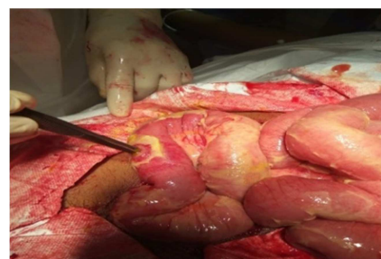
Figure 1. Ileal peritonitis of traumatic origin.

Of the 80 patients (59.25%) seen again after a follow-up of 2 years, 6 were reviewed for a late complication, including 4 postoperative eventrations (5.0%) and 2 OIA by flanges (2.5%).