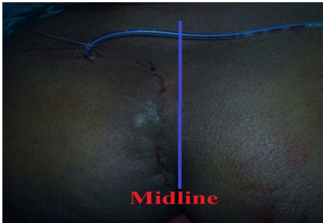
Figure 3. Skin closure after cleft lift procedure and releasing of right skin flap. (The Wound is to the left of midline and not under tension).

Asymmetrical excision created a flap, which is pulled past the natal cleft to the contralateral side. Skin flap is freed from the right side and advanced across the midline to be sutured to the other, and suction drain was fixed under subcutaneous tissues. Subcutaneous tissue were closed with sutures with Vicryl 3/0, skin was closed by interrupted 3/0 Prolene sutures or subcuticular Vicryl 3/0 in some cases ( Figure 3 ).