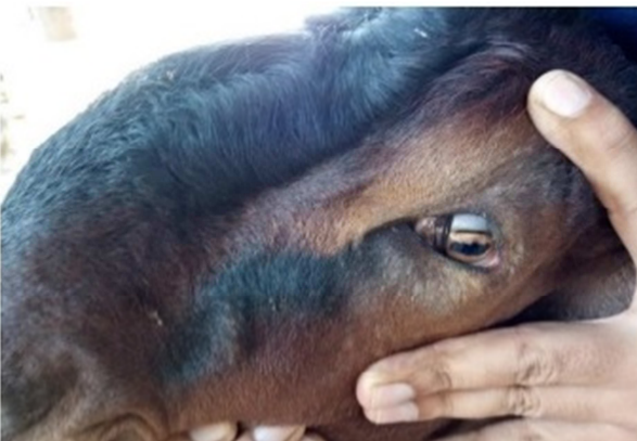
Figure 2. Prolaps of 3 rd eye lid of tetanus affected buck.

The buck's tail was tight and upright ("pump handle tail"). Muscle stiffness in the fore and rear limbs was discovered during a physical examination. Trismus (jaw muscle spasm), nictitating membrane prolapse, and hyperesthesia were also observed (Figure 2).