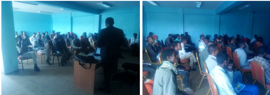
Figure 1. Photos during training.