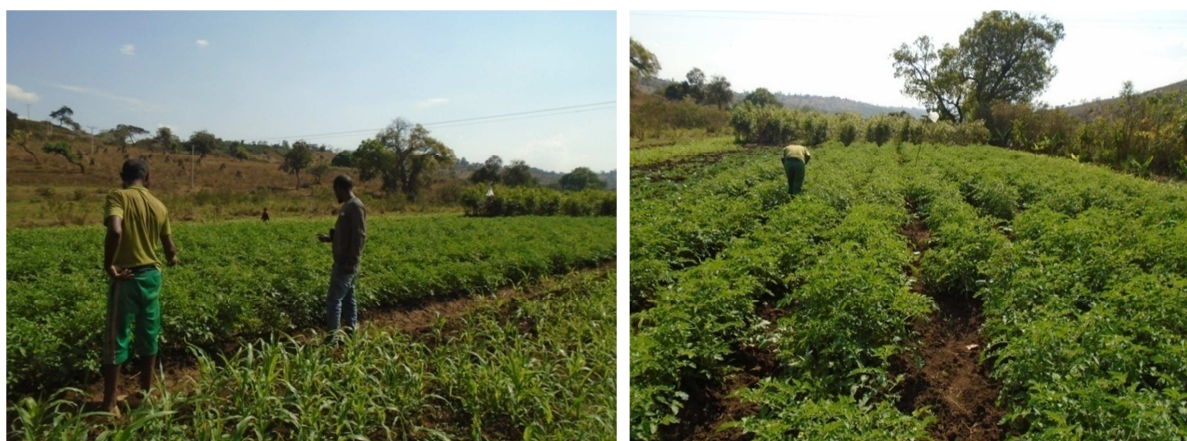
Figure 3. PED of Tomato under irrigation Hawa Galan (Ganda 18), 2021.