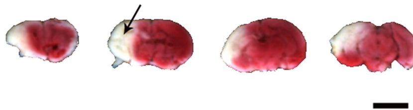
Figure 1. The results of TTC staining.

Data is expressed as mean \pm standard error. Statistical