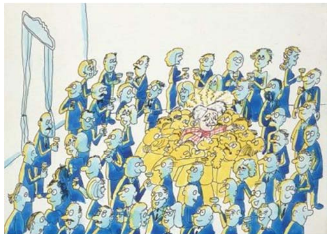
Figure 4. Illustration III.

This increases his resistance to movement, in other words, he acquires mass, just like a particle moving through the Higgs field. If a rumour across the room, it create the same kind of clustering, but this time among the scientists themselves. In this analogy, these clusters are the Higgs particles.