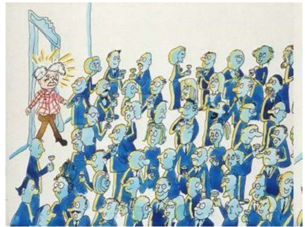
Figure 3. Illustration II.

From Figure 2 illustration I, a well-known scientist walk in, creating a disturbance as he moves across the room, and attracting a cluster of admirers with each step.