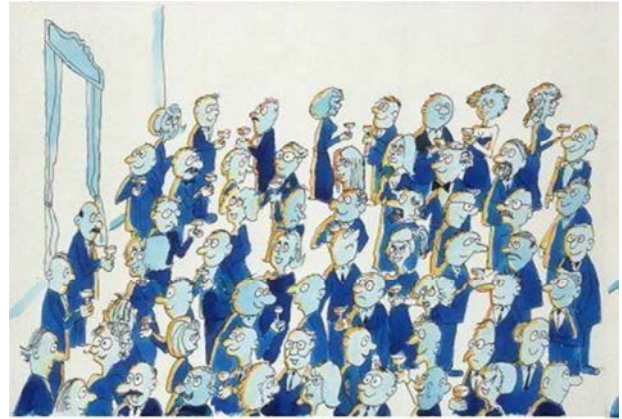
Figure 2. Illustration I.