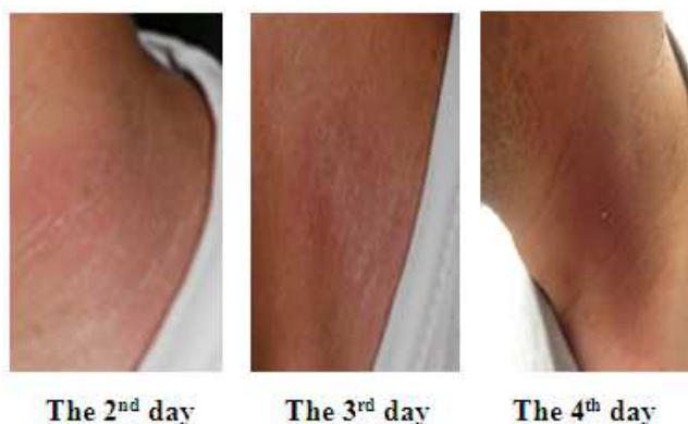
Fig. 2: Evolution of the lesion for observation number 1.

Observation viewed on the 1st patient: (Fig. 2), 10 days after my arrival in the area, the below symptoms displayed in left side of neck are the origin of a pain with an itching sensation on the skin that evolved the next day into a very limited and regular erythematous closet contours centered brownish papule that turns into the third day into an intense sensation of burns and erythema with excruciating headache.