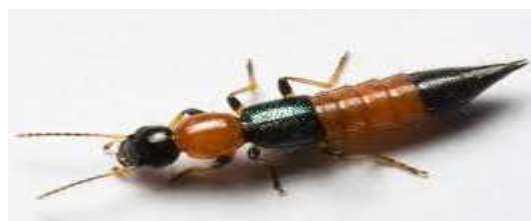
Fig.1: PAEDERUS RIPARIUS

In fact, I have, through the ensuing of six cases, shed light on the clinical appearance and evolution of this dermatitis [3].