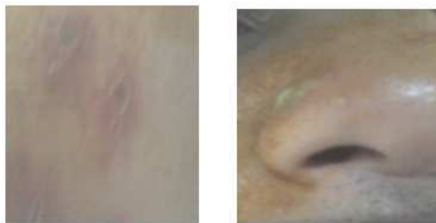
Fig. 3: double localization: nose and at the inguinal crease

Observation got from the 2nd patient: (Fig. 3) double localization: nose and at the inguinal crease with increasing evolution of the burning sensation and erythema over four days.