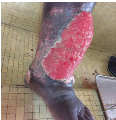
Figure 4. A basal cell carcinoma that presents in its hemogram a pancytopenia.

erythrocytes 3750000, hemoglobin 8.8g / dl, hematocrit 26.2%, TGMH 23pg Evidence of hypochromic microcytic anemia