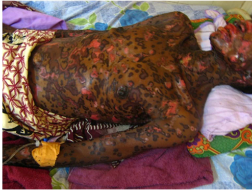
Figure 3. Serious toxicosis (Lyell syndrome) with Hematologic result.

erythrocytes 3750000, hemoglobin 8.8g / dl, hematocrit 26.2%, TGMH 23pg Evidence of hypochromic microcytic anemia