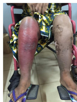
Figure 2. Inflammatory, microcytic, normochromic anemia in an inpatient patient with erysipelas.

neutrophils, are involved in bacterial infections [8, 9]. Hyperlymphocytosis was observed in 14.6% of cases and was related to inflammatory dermatoses such as toxidermies (Figure 3), autoimmune bullous dermatoses. This is explained by the large production of antibodies during these dermatosis. Some lepromatous and tuberculous skin patients had monocytosis. This monocytosis was reaction and due to reversion reactions by regain of cellular immunity. Thrombocytopenia was observed in 28% of cases and this thrombocytopenia was linked to the microsubition of certain dermatoses especially tumoral (cutaneous carcinomas). Pancytopenia was observed in 11 patients, ie 8.23%. This pancytopenia was related to cutaneous carcinomas (basal cell and squamous cells) (Figure 4). People living with hiv / aids had lymphopenia with a CD4 T cell count of less than 250 mm3 in 67.4% of cases. this result indicates severe immunodepression in these patients. This result is comparable to that of Zannou DM et al who respectively found a CD4 <250 / mm3 in 59.6% and 50.91% and 54.2% of the cases [10].