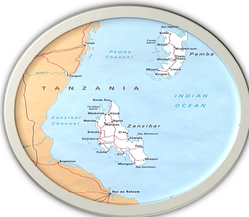
Figure 2. Location of Zanzibar Island.

This study conducted at coastal areas of Zanzibar Island.