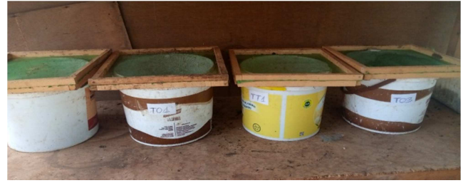
Figure 1. Experimental set up.

The circular plastic containers ( \varnothing 30 \times 12 cm) were used to carry out the experimentations. Those containers were covered with mosquito nets to prevent black soldier fly larvae predators and to avoid the presence of housefly larvae in the containers as shown in Figure 1 .