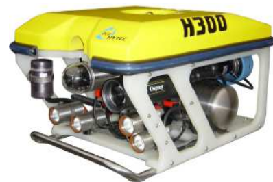
Figure 1. ROV System.

depths. Signs of deterioration/ defect could be seen at few locations. In masonry, the pointing is intact on all over the places where images were captured. The mortar in rubble masonry is not missing in the observed locations. Cracked mortar was not visible. Cavities could not be detected. Algae growth was visible in many places [9] [10]. The concrete portion of the trash racks, that is the slab and columns are generally intact at all depths. Grouting marks could not be observed in the masonry portions. ROV could not be piloted below 530ft elevation due to wooden debris or other obstructions (Figure 3 & 4). In front of the trash racks and at the bottom of masonry portion, wooden branches as debris were visible in many places (Figure 3). Heap of stones were found at EL 522 ft inside the trash racks (Figure 4), which is above the invert level of the inlet of the penstock. No other defects were seen in trash racks. The cross section of the horizontal member of the trash rack looks like I section and the vertical member rectangular. In this I section, stones were found lying at many places in the horizontal members (Figure 5) [10].