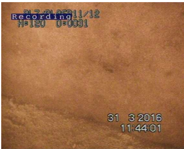
Figure 12. Good concrete at bottom of gate groove of SB 11at EL513ft.