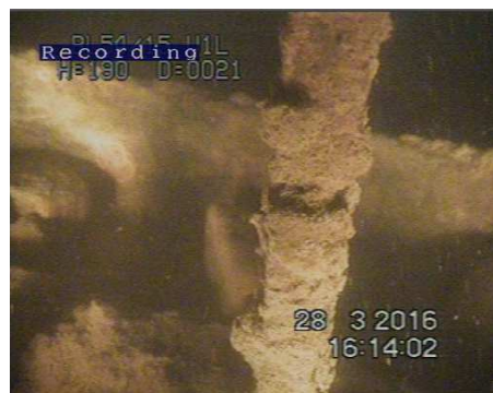
Figure 5. Stones found on horizontal members of left trash racks in Unit 1 at EL547ft.