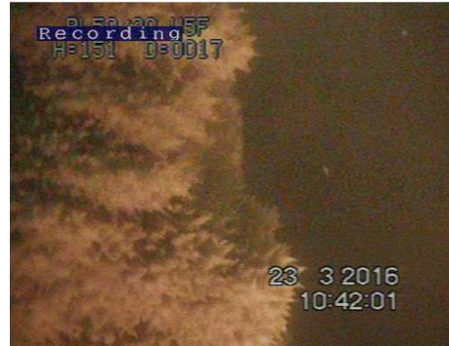
Figure 6. Heavy growth of algae on the vertical members of trash racks of Unit 5 at EL 561ft.