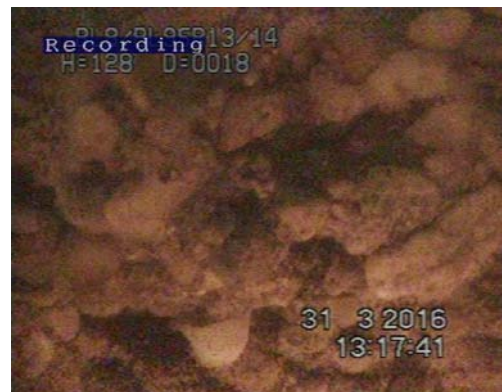
Figure 8. Honey combing in concrete between SB13 and SB14 at EL 556ft.