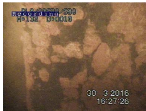
Figure 9. Anomaly on the left gate guide of SB9 at EL 556ft.