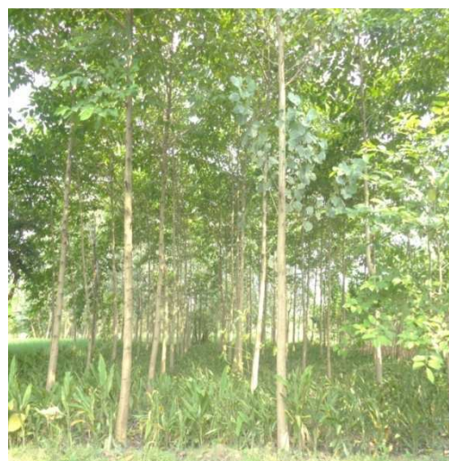
Fig. 10. A. cadamba Plantation in Agroforestry