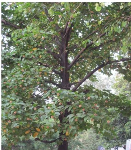
Fig. 2. Anthocephalus cadamba Tree