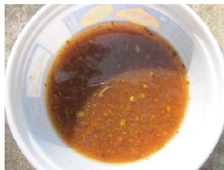
Fig. 7. Slurry of A. cadamba