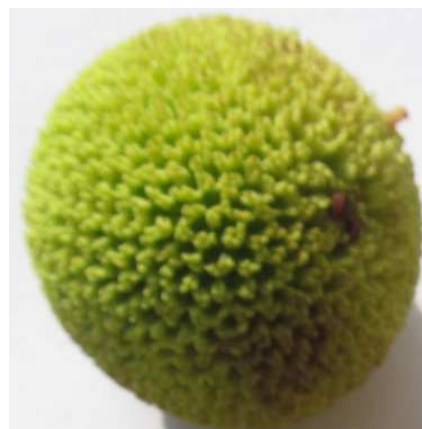
Fig. 5. Fruit of A. cadamba