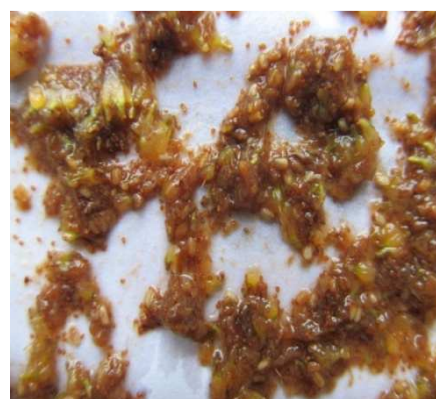
Fig. 6. Rubbed fruits of A. cadamba