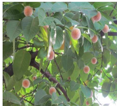
Fig. 3. Leaves and Flowers of A. cadamba