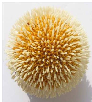
Fig. 4. Flower of A. cadamba