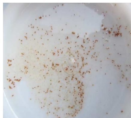
Fig. 8. Seeds of A. cadamba