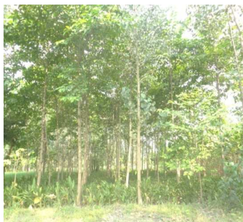
Fig. 9. A. cadamba Plantation in Agroforestry

There is need to extend the A. cadamba tree adoption in farms through extension and build the linkages for industrial and other uses of tree for better markets and economic returns from the crop. A. cadamba has potential to yield good returns in agroforestry especially in sub humid and humid tropics (Figure 9 & 10). Though scattered adoption by farmers for the A. cadamba is there but systematic agroforestry system research is required by monitoring and evaluation of multiplication trials of elite germplasm of species developed by different institutes. Considering the importance of A. cadamba , it is being cultivated in various parts of India including various regions of Bihar state like Katihar, Purnia, Madhepura, Araria, Supoal, Saharsa, Muzaffarpur, Samastipur, Vaishali, Khagaria, Chapra, West champaran, East champaran, Begusaria and Darbhanga under agroforestry systems.