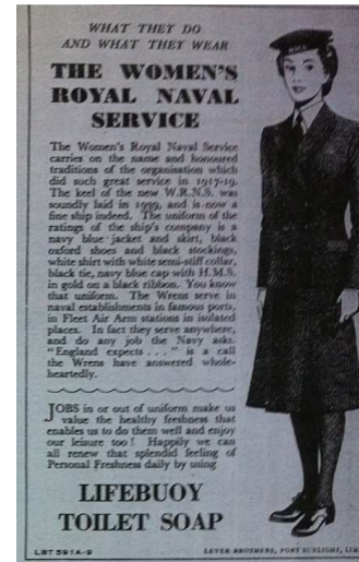
Figure 6. The WRENS (1939).

The WRNS uniform was the most popular of women's military uniforms. Figure 5 shows the uniform of the WRNS in 1918. The uniform for the Second World War changed in skirt length and hat shape. The length of the skirt's uniform was shortened, and the hat lost its brim and became smarter. The new WRNS uniform was seen in public for the first time at the National Service parade in Hyde Park in July 1939. One advertisement for the 'Lifebuoy Toilet Soap' in 1943 introduced the uniform for the Wrens [another abbreviation for Women's Royal Naval Service] (Figure 6).