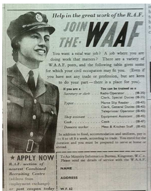
Figure 19. 'Join the WAAF'.

An advertisement to recruit the WAAF was inserted in The Woman on 22 February 1941 (Figure 19). [40] There the woman wore the uniform that was inspired by that of the ATS, and also by that of the RAF airman's service. The WAAF uniform was based on the design of the RAF uniform. It was called 'the Royal Air Force blue uniform'. The colour called 'air force blue' was considered as characteristic of the WAAF. The jacket consisted of pleated breast pockets, large tunic skirt pockets and integral waist belt. [13]