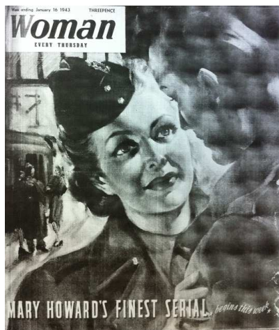
Figure 14. 'A.T.F. Woman in Cover Page'.

As soon as the military uniform was established, many advertisements for the promotion of using laundry and encouragement of selling weekly newspaper and commodities such as cocoa and toothpaste began to appear. ATS women in uniform who 'show frequently their splendid work', were utilised for these various advertisements. [26, 27, 28]