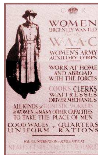
Figure 9. 'W.A.A.C. (1916)'.

The Women's Army Auxiliary Corps (WAAC) played an active role in the First World War. On 31 March 1917, WAAC women wore their khaki uniforms when they landed in France. Military-style khaki jackets were worn not only by officers but also by some drivers, with the long skirts. The ranks wore pudding basin felt hats, and the officers wore man-style peaked caps. Figure 9 is a WAAC recruiting poster at the end of 1916. [19] Women in this poster put pudding basin felt hats on their heads. Figure 10 is the uniform for WAAC in 1917. The uniform was made of 'khaki wool gabardine suit with a beige silk shirt' and it was supplied by George B. Ashford Ltd of Birmingham, and the label "Woodrow, Piccadilly, London" was stuck on the khaki felt hat. [20] The WAAC was renamed the Queen Mary's Army Auxiliary Corps in May 1918, which ended up until 1919. The WAAC uniform was succeeded by that of the Army Auxiliary Corps (ATS), which was established in September 1938.