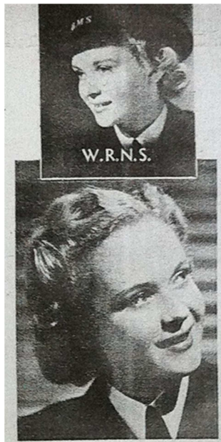
Figure 7. 'H.M.S.'.

nylons have replaced the stockings and a pair of smart black court shoes has been added to the quota of uniform'. [12]