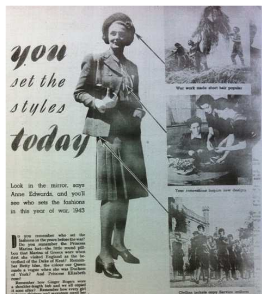
Figure 2. 'You set the Styles Today'.

As the caption that 'Twins in navy wool as smart for the Wren [Women's Royal Naval Service] as it is warm for her brother' in the article 'H.M.S. [His Majesty's Service] WAISTCOAT!' shows in Figure 3, this waistcoat was based on the WRNS [Women's Royal Naval Service] uniform. [8] In this way, some civilian clothing imitated the military uniform, and some parts of the military uniforms turned into those of civilian clothes.