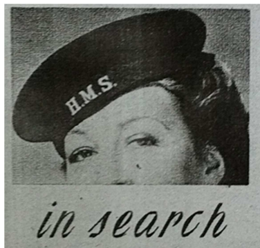
Figure 8. 'W.R.N.S.'.