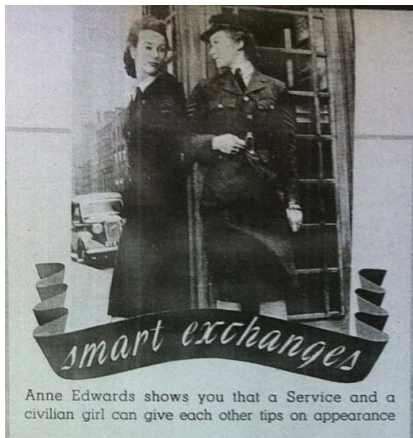
Figure 4. 'Smart Exchange'.

In the article, 'Smart exchanges', Anne Edwards shows her readers again that 'a service and a civilian girl could give each other tips on appearance' (Figure 4). [9] During the War, service and civilian girls gave each other hints and drew inspirations mutually. This partly means that military uniforms were very similar to civilian clothes and that military uniform was an icon of admiration for the civilian girls.