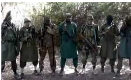
Figure 10. BH terrorists.