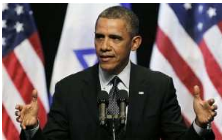
Figure 7. American President, Barack Obama on Terrorism.