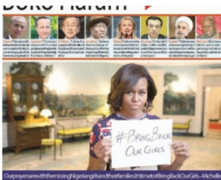
Figure 8. The American first lady, Michelle Obama on Support for the girls.