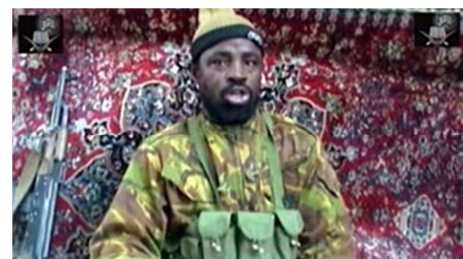
Figure 4. Abubakar Shekau is presented as a leader in command