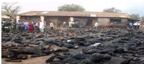
Figure 19. Corpses BH victims 1.