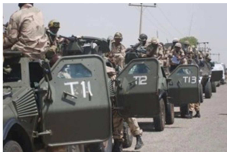
Figure 11. Nigerian army combating BH terrorists.