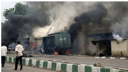
Figure 17. Property set ablaze 3.