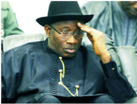
Figure 6. Dr Goodluck Jonathan as worried by the killings 2.