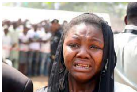
Figure 9. BH victim or sympathiser.