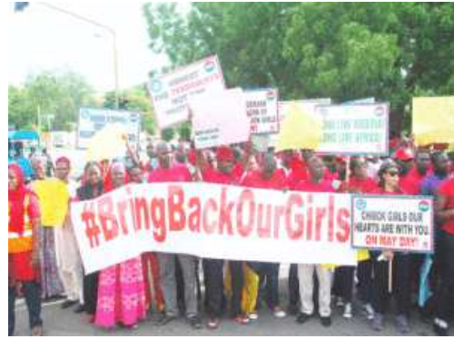
Figure 12. Peaceful protesters 1.