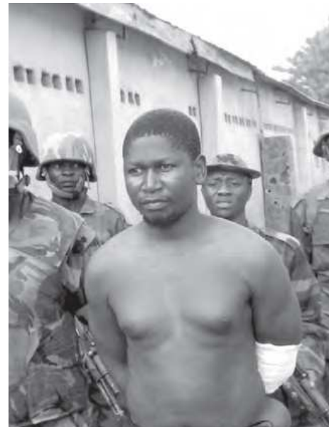
Figure 3. Mohammed Yusuf as a defeated and captured leader.

Participants are pictorially individualised. This has to do with the singularity of pictorial representation, that is the individual representation of social actors. In Figures 3-9, many actors are visually individualised by shots that show only one person.