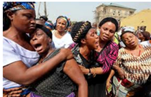
Figure 15. Sobbing victims.