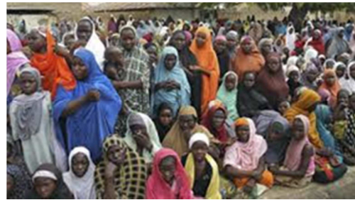
Figure 21. Kidnapped girls 1.