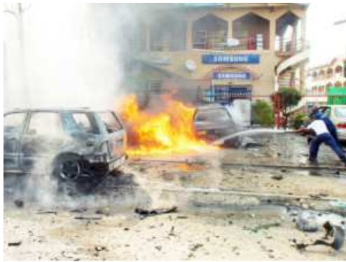
Figure 16. Property set ablaze 2.