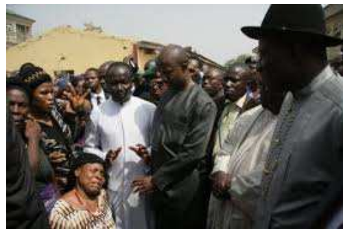
Figure 22. Sobbing victims and the president.