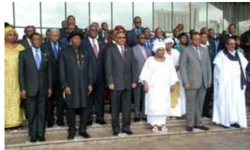
Figure 14. World leaders.