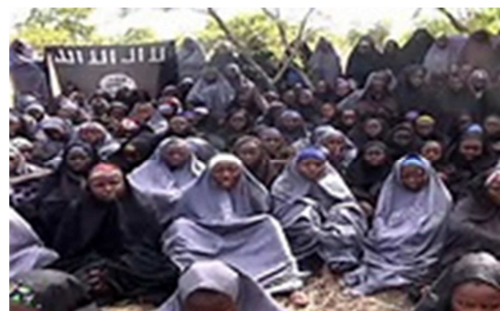
Figure 23. Kidnapped girls 2.

The represented images are recorded in high modality. The light, shadow and color, where the images are in color, are as we might expect in the real world. The fire flames reveal the authenticity of the mayhem and the detonation of 'bombs' in different locations in the northern part of the country. The northeastern part of the country is populated by Muslims and the representation of victims (women dressed in Islamic way) in Figure 21 relates to reality. The girls in Figure 23 are the kidnapped school girls from the Chibok community, a Christian dominated school. The presentation of the picture is to show that they are real, alive and have all been islamised, at least, by attire.