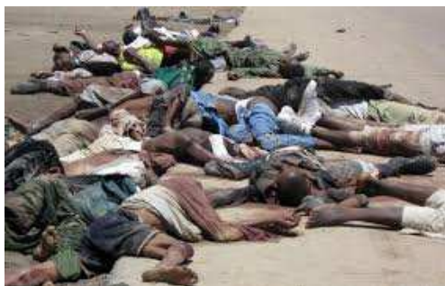
Figure 20. Corpses BH victims 2.