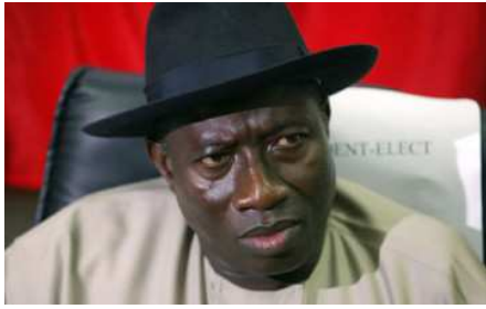
Figure 5. Dr Goodluck Jonathan as worried by the killings 1.