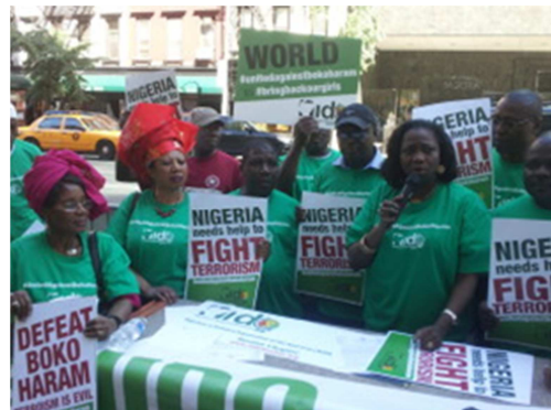
Figure 13. Peaceful protesters 2.