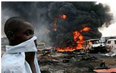
Figure 18. Property set ablaze 1.